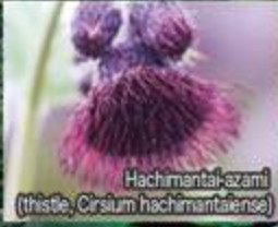
Hachimantai-azami (thistle, Cirsium hachimantaense )