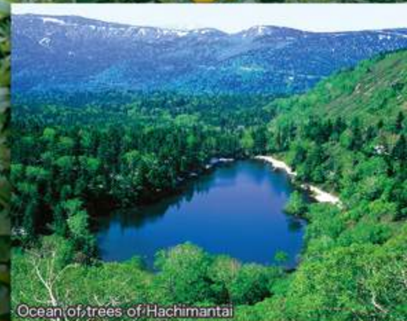
Ocean of trees of Hachimantai