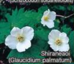
Shiraneaoi ( Glaucidium palmatum )