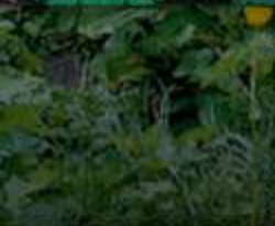
Ezo-oyama-rindo ( Gentiana triflora var. japonica subvar. montana )