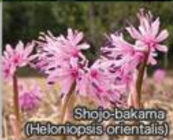
Shojo-bakama ( Heloniopsis orientalis )