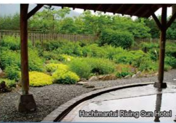
Hachimantai Rising Sun Hotel