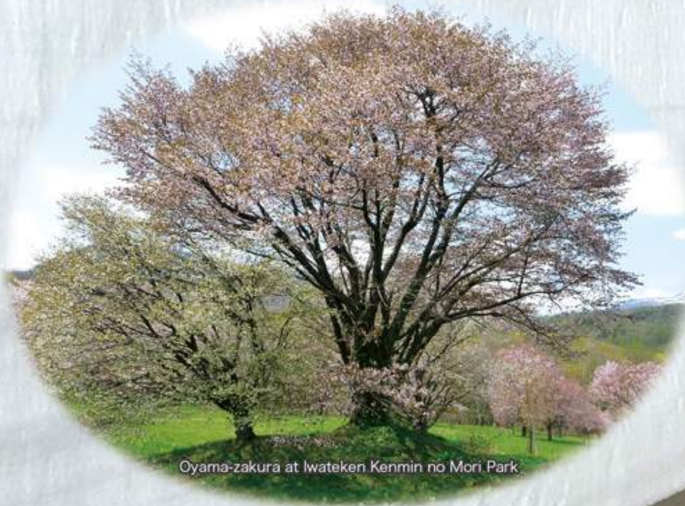
Oyama-zakura at Iwateken Kenmin no Mori Park