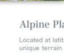
Kobakeso ( Veratrum stamineum )