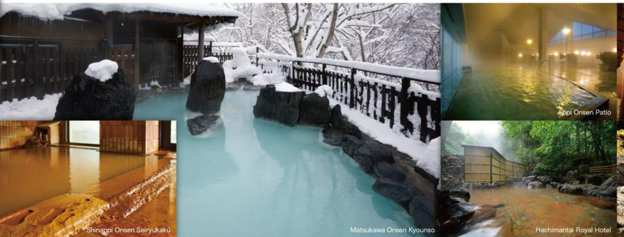
Shinappi Onsen Seiryukaku