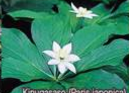
Kinugasaso ( Paris japonica )