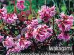
Iwakagami ( Schizocodon soldanelloides )