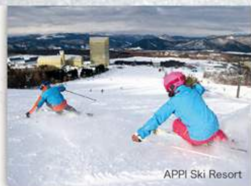
APPI Ski Resort

The huge slopes of 21 courses that amount to 45,100 meters in total length have "aspirin snow," which is high-quality, dry powder snow blessed by the natural environment here. The staff carefully check and maintain the slopes every night in order for skiers and snowboarders to enjoy the snow at its best condition.