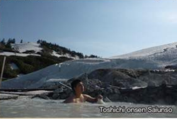
Toshichi onsen Saiunso

surrounded by picturesque scenery of Hachimantai!